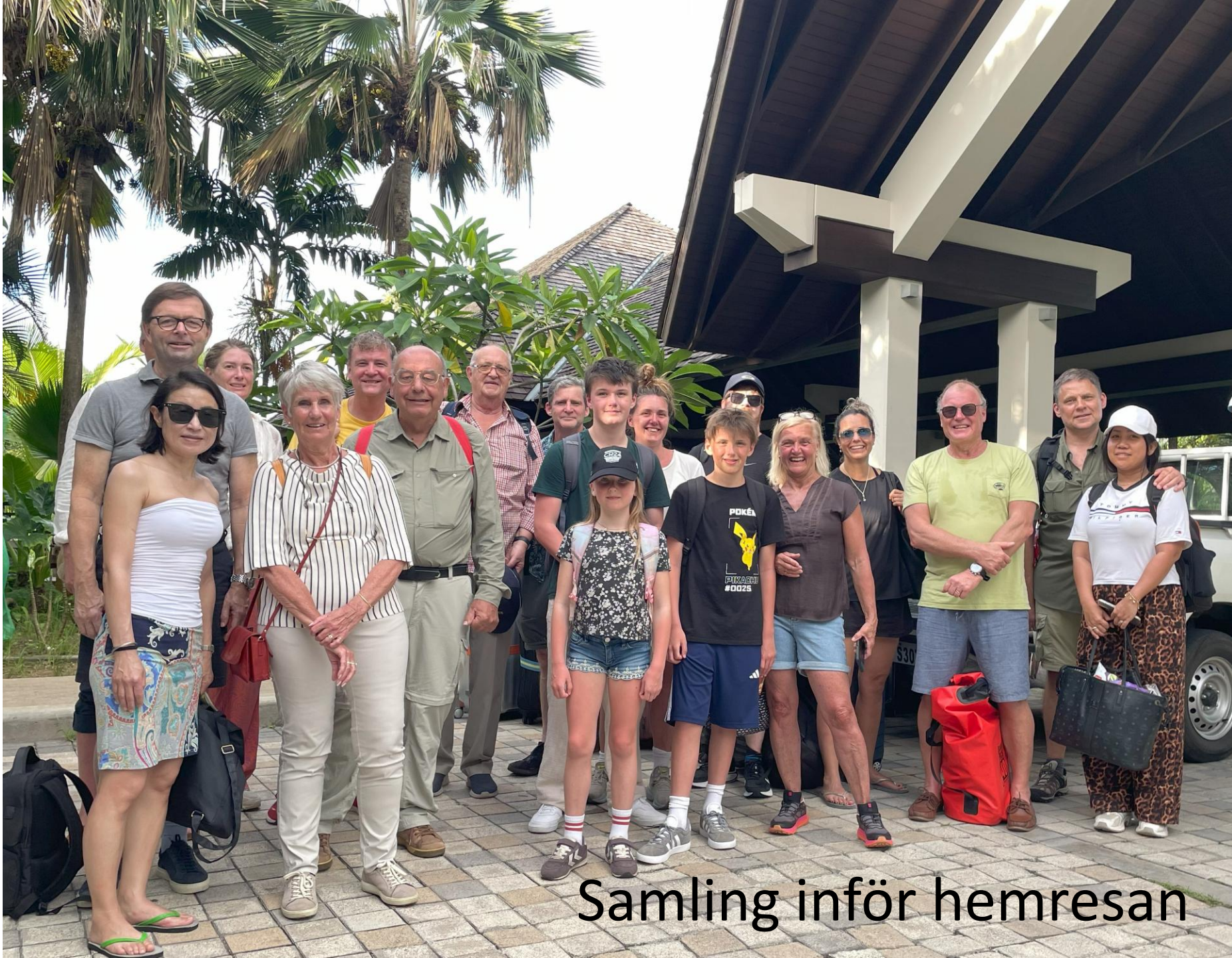
Samling inför hemresan