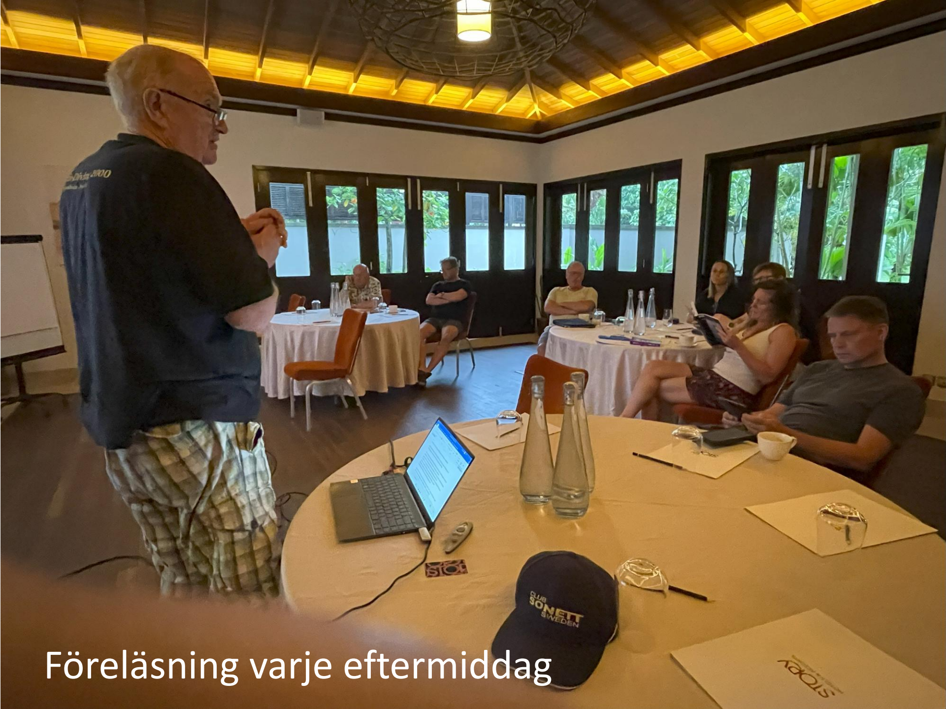
Föreläsning varje eftermiddag