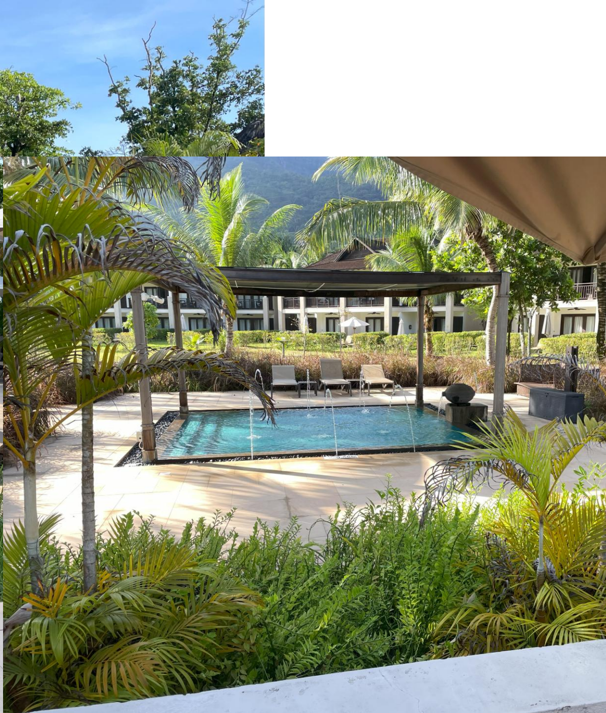
Pooler för vuxna och för barn